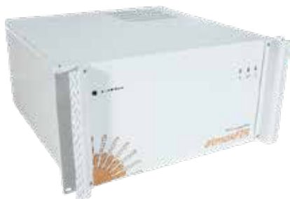
Figure 2 - atmosFIR FTIR analyser – High Resolution and 19" rack ready for installation.

By using the atmosFIR gas analyser platform based on FTIR spectroscopy, Protea can speciate complex mixtures of hundreds of VOCs quickly and accurately. As an example, Fig. 1 lists 25+ components from an engine emission application, where Protea provided a system that would qualify and quantify using atmosFIR.